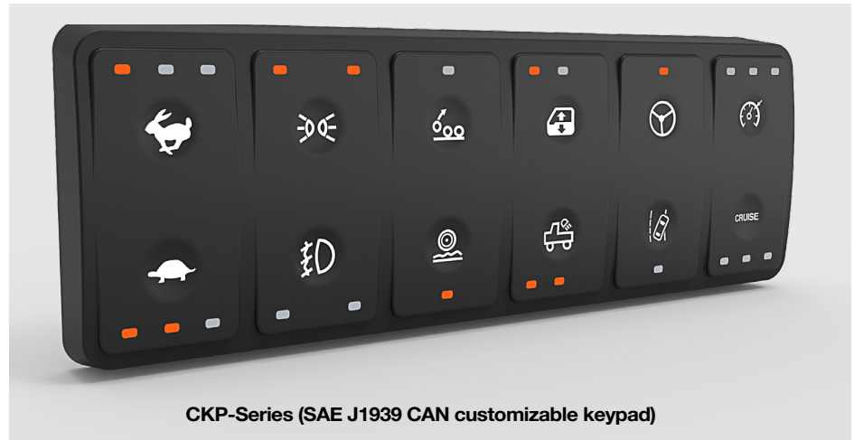
CKP-Series (SAE J1939 CAN customizable keypad)