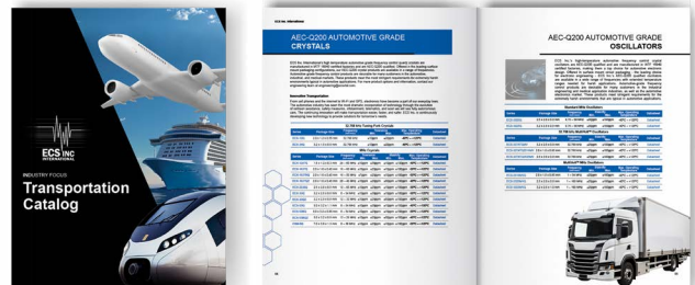
Interactive Automotive Catalog